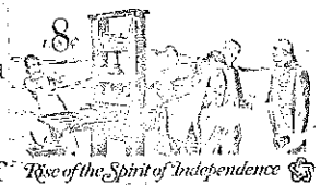
Rise of the Spirit of Independence

Dear Dick, No No No the world of used car lots, space probes and broadcast salesmanship already exists. You and I have met in the hallway of the AM school pushing brooms, and between us we have some cutout scraps and a few torn pages maybe and a burnt out light bulb. If